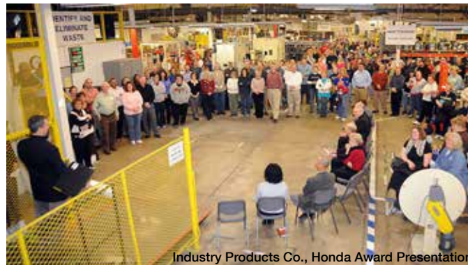
Industry Products Co., Honda Award Presentation