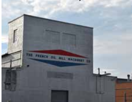
The French Oil Mill Machinery Co.