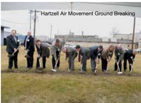
Hartzell Air Movement Ground Breaking

Available waste water treatment capacity exceeds 1 million gallons per day.