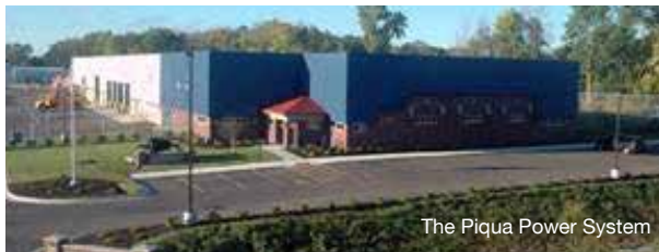
The Piqua Power System

The Piqua Power System moved into a newly constructed, technology-laden facility in 2012, which has enhanced security, operational and energy efficiency. As an RP3 recipient, the designation is proof of reliability and shines a light on the utility for the excellent service it provides.