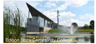
Edison State Community College