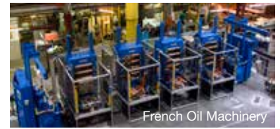
French Oil Machinery

Average restoration time less than 60 minutes.