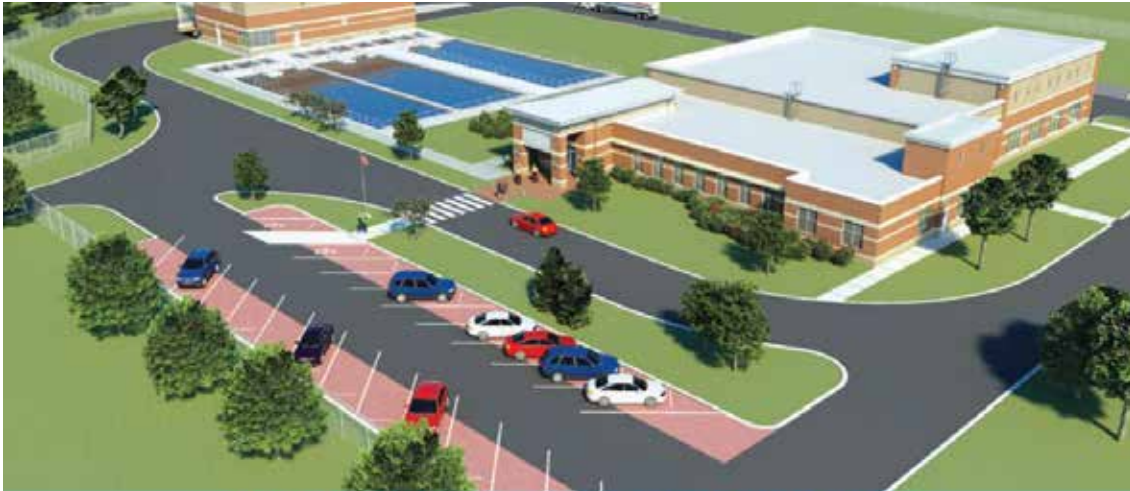
New Water Treatment Plant Rendering

The Piqua Municipal Water System operates a 7.0 million gallon per day surface water treatment plant, maintains over 110 miles of water main , two booster pump stations, and four elevated water storage tanks to supply water. The system meets Federal and State health standards to the residential, commercial, and industrial customers of the City of Piqua.